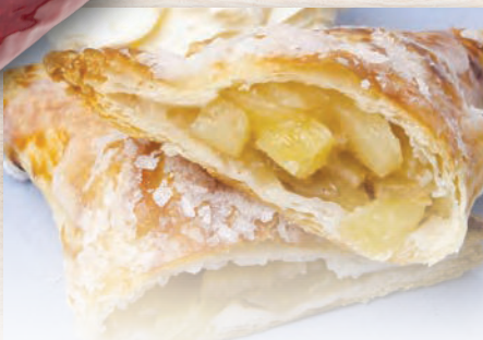
CRISPS AND FRUIT SQUARES

Perfect for filling, icing, topping and much more.